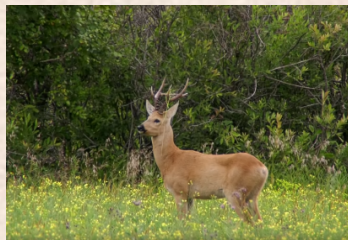
Asiatic Roe Deer