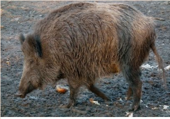
Wild Boar (Asia)