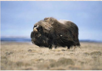
Musk Ox (North America)