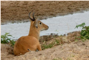
Reedbuck, Bohor/Reedbuck, Bohor