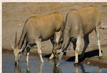
Eland, Cape/Livingstone, Patterson's