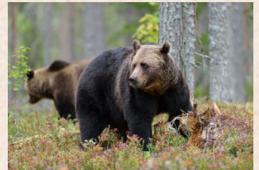
Brown Bear (Europe)