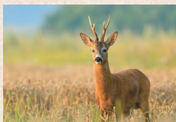
Buck/Roe Buck/Roe Deer (Europe)