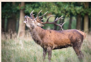
Red Deer/Red Stag (Europe)