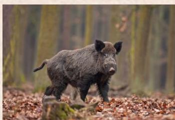
Wild Boar (Europe)