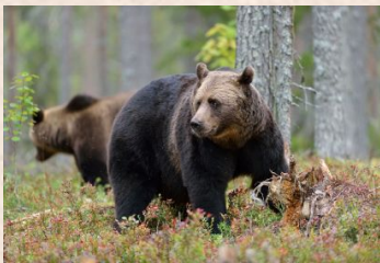
Brown Bear (Europe)