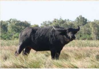
Wild Water Buffalo (Oceania)