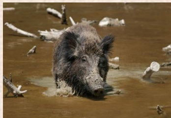
Wild Boar (Oceania)