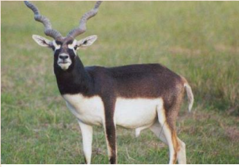
Blackbuck Antelope (Oceanien)