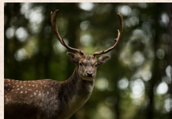
Fallow Deer (Oceania)