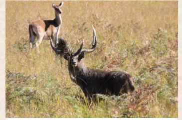
Moluccan Rusa Deer