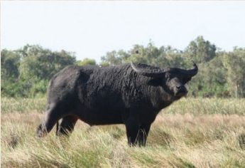
Wild Water Buffalo (Oceania)