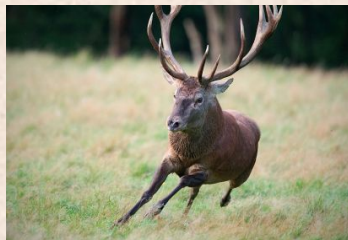
Red Deer/Red Stag (Oceania)