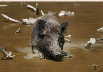
Wild Boar (Oceania)