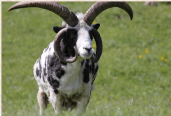
Multi-horned sheep (South America)