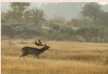
Fallow Deer (South America)