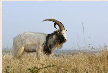
Feral Goat (South America)