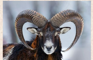
Mouflon (South America)