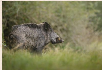
Wild Boar (South America)