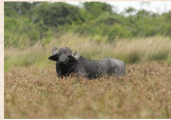
Water Buffalo (South America)