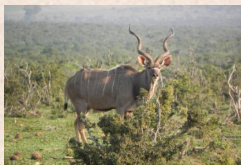
Kudu, East Cape