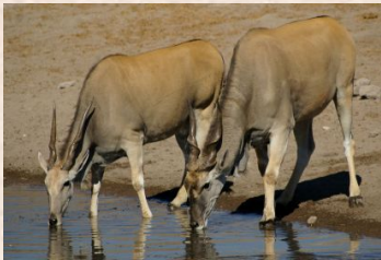
Eland, Cape/Livingstone, Patterson's