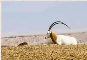
Scimitar Oryx/Scimitar- Horned Oryx