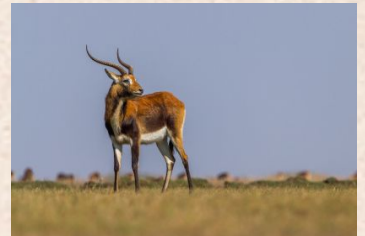
Red Lechwe/Black Lechwe/Kafue