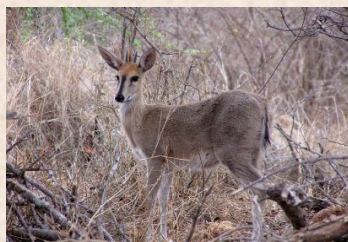
Duiker, Grey/Duiker, Grimm's (Common)