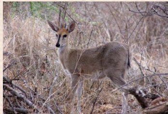
Duiker, Grey/Duiker, Grimm's (Common)