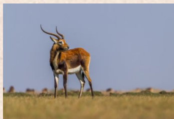
Red Lechwe/Black Lechwe/Kafue