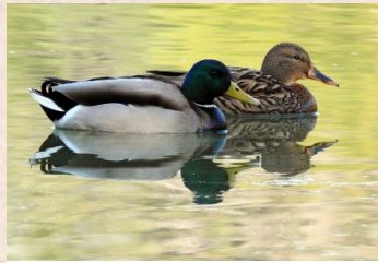
Duck / Mallard