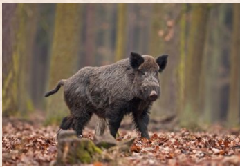
Wild Boar (Europe)