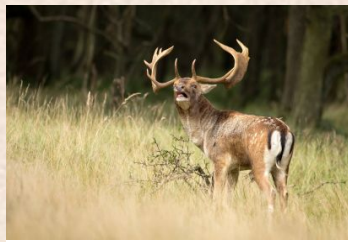
Fallow Deer (Europe)