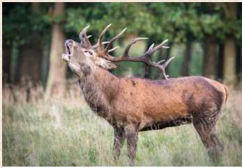
Red Deer/Red Stag (Europe)