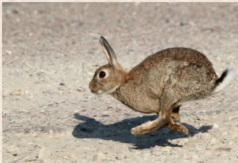
Rabbit, European Wild